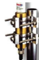
FM2 Mounting Kit (Sold separately)

Americas: +1.847.839.6925 IAS-AmericasSales@lairdtech.com