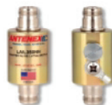
Lightning Arrestor LABH350NN (Sold Separately)